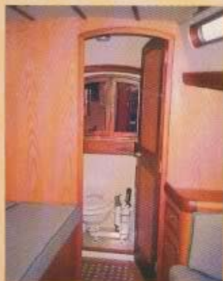
The en-suite head compartment up forward

Basic equipment includes a 60lb (27.2kg) CQR anchor attached to 30 fathoms of 3/8in calibrated chain. This is handled by a Simpson-Lawrence Seawolf electric windlass. Sprayhood, mainsail cover and three fire extinguishers are also included in the basic price. On reflection, the basic price of this yacht is pretty substantial - one can buy one-and-a-half Swan 43s for the price of a single Sirius 42.