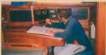
Top , all controls are led aft to the cockpit. Above , a good navigation station.