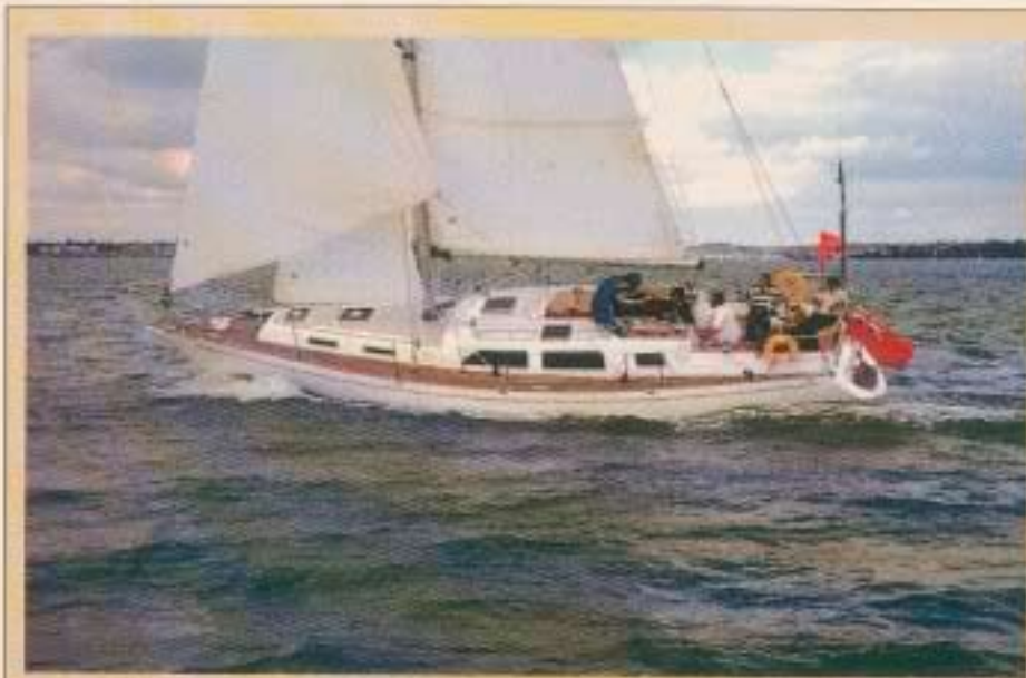
The cutter rigged Sirius was well balanced on all points

The navigating area is provided with a large, desk-top chart table with adequate stowage. There seemed to be plenty of room for sailing instruments and