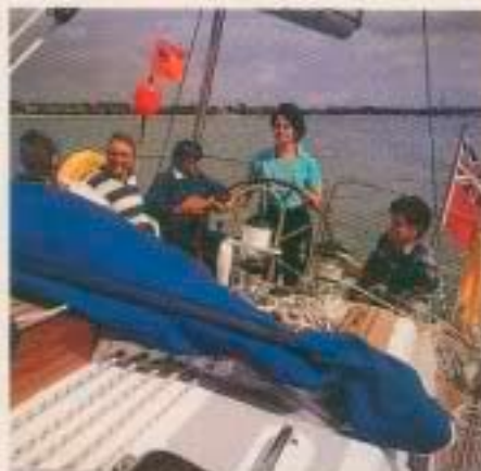
The Sirius is an easy boat to sail and there's plenty of room in the cockpit

Under power, the yacht tracks well and machinery noise levels are low at cruising revs. There is negligible vibration and no feeling of prop wash over the